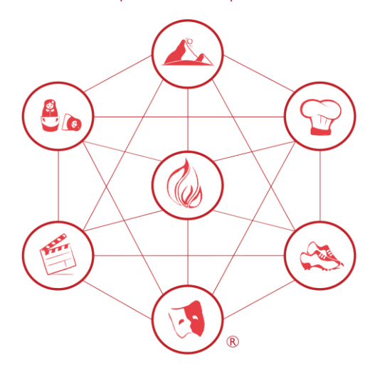
The 7 Metaphors for Leadership Transformation®